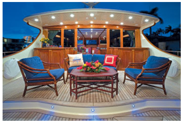
Cockpit / salon entry